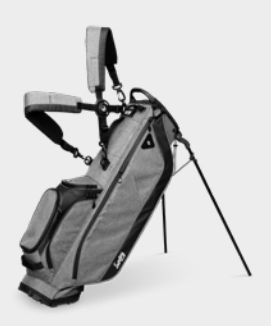
BAG403 | HEATHER GRAY