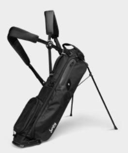
EL CAMINO BAG301 | MATTE BLACK