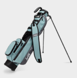
LOMA BAG BAG105 | SEAFOAM