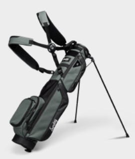
BAG204 | MIDNIGHT GREEN