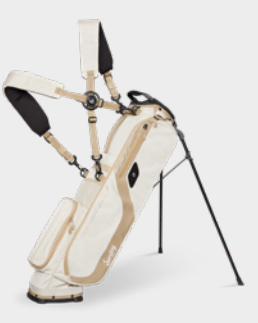
BAG322 | TOASTED ALMOND