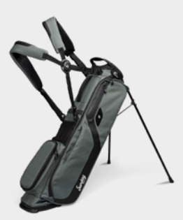
BAG304 | MIDNIGHT GREEN