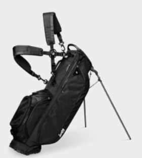
BAG401 | MATTE BLACK