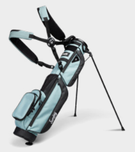
BAG205 | SEAFOAM