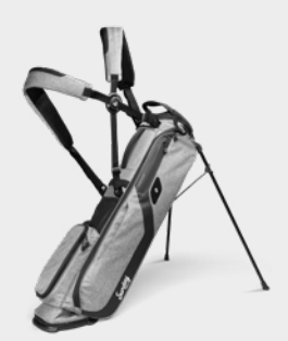
BAG303 | HEATHER GRAY