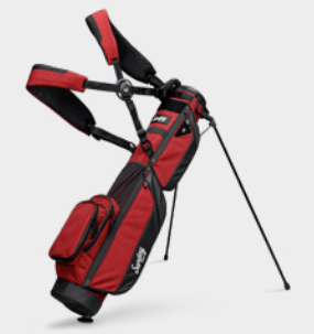
{\tt BAG207} \mid \textbf{RON BURGUNDY}