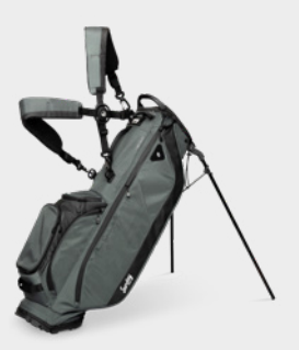
RYDER 23 BAG404 | MIDNIGHT GREEN