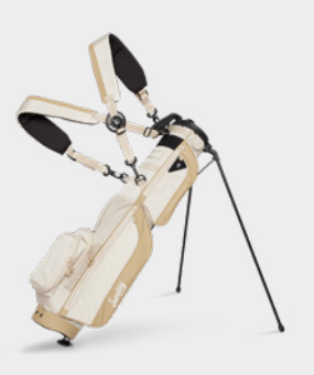
LOMA XL BAG222 | TOASTED ALMOND