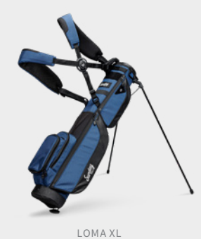
BAG202 | COBALT BLUE