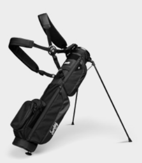
LOMA XL BAG201 | MATTE BLACK