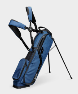
BAG302 | COBALT BLUE