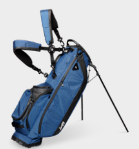
BAG402 | NAVY BLUE