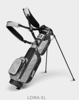
BAG203 | HEATHER GRAY