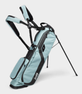
BAG305 | SEAFOAM