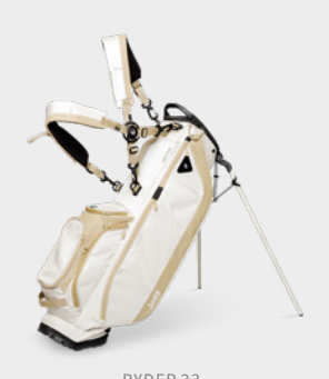
BAG405 | TOASTED ALMOND